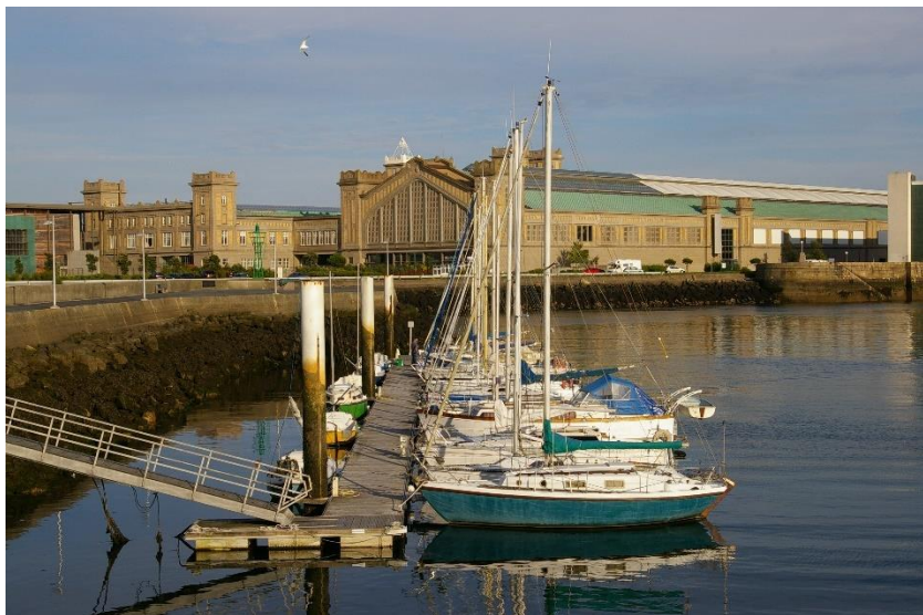
Cité de la mer - Cherbourg

(1) Or in an equivalent currency: Swedish krona or Romanian leu (in accordance with European regulation No.924)