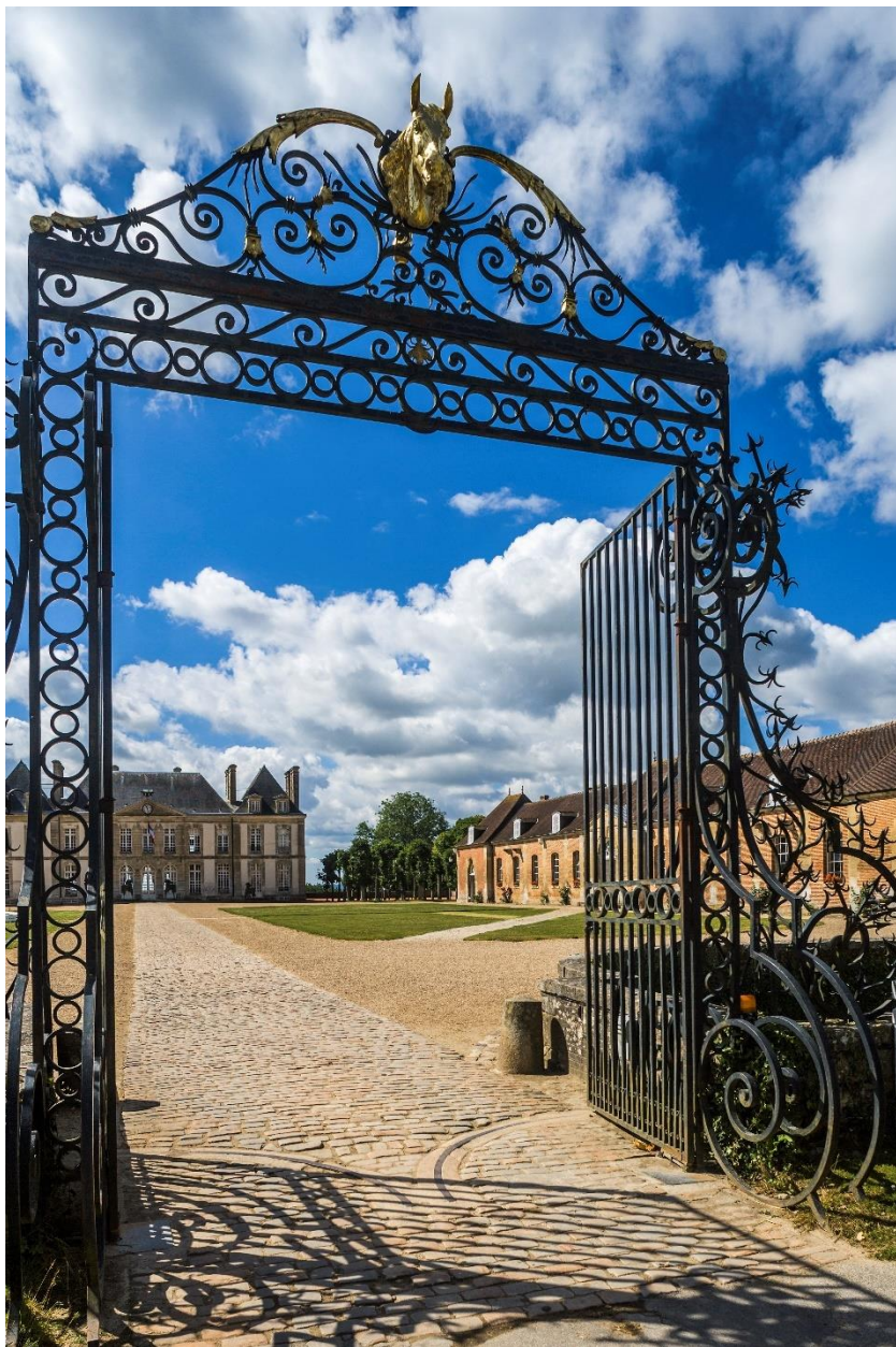
Haras du pin

Transactions that can be carried out independently from your online banking or the Ma Banque app will be charged if they are made by an advisor in a branch or remotely (by phone or email):