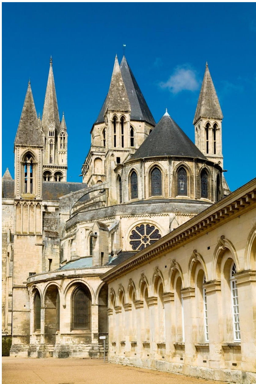
Abbaye aux hommes