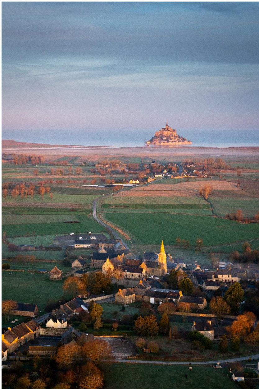
Mont Saint Michel