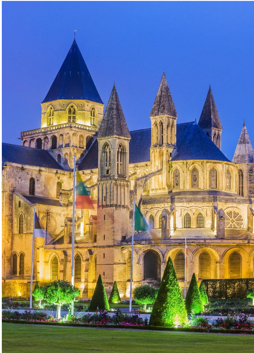
Abbaye aux hommes

● The services identified by this symbol are the basic services mentioned in Article D.312-5 of the French Monetary and Financial Code.