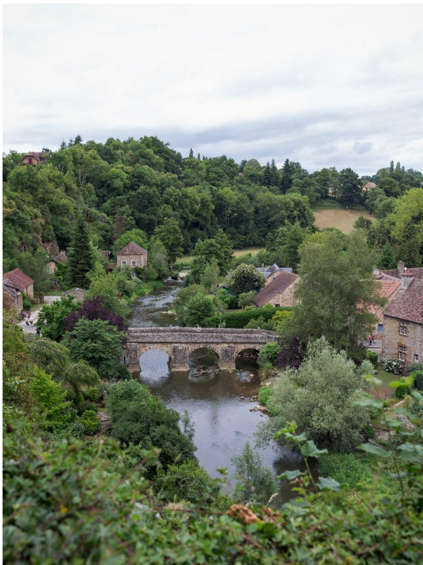
Saint Cénerie -Le-Gérei

(1) The amounts include, if applicable, the unauthorised transaction handling fee.