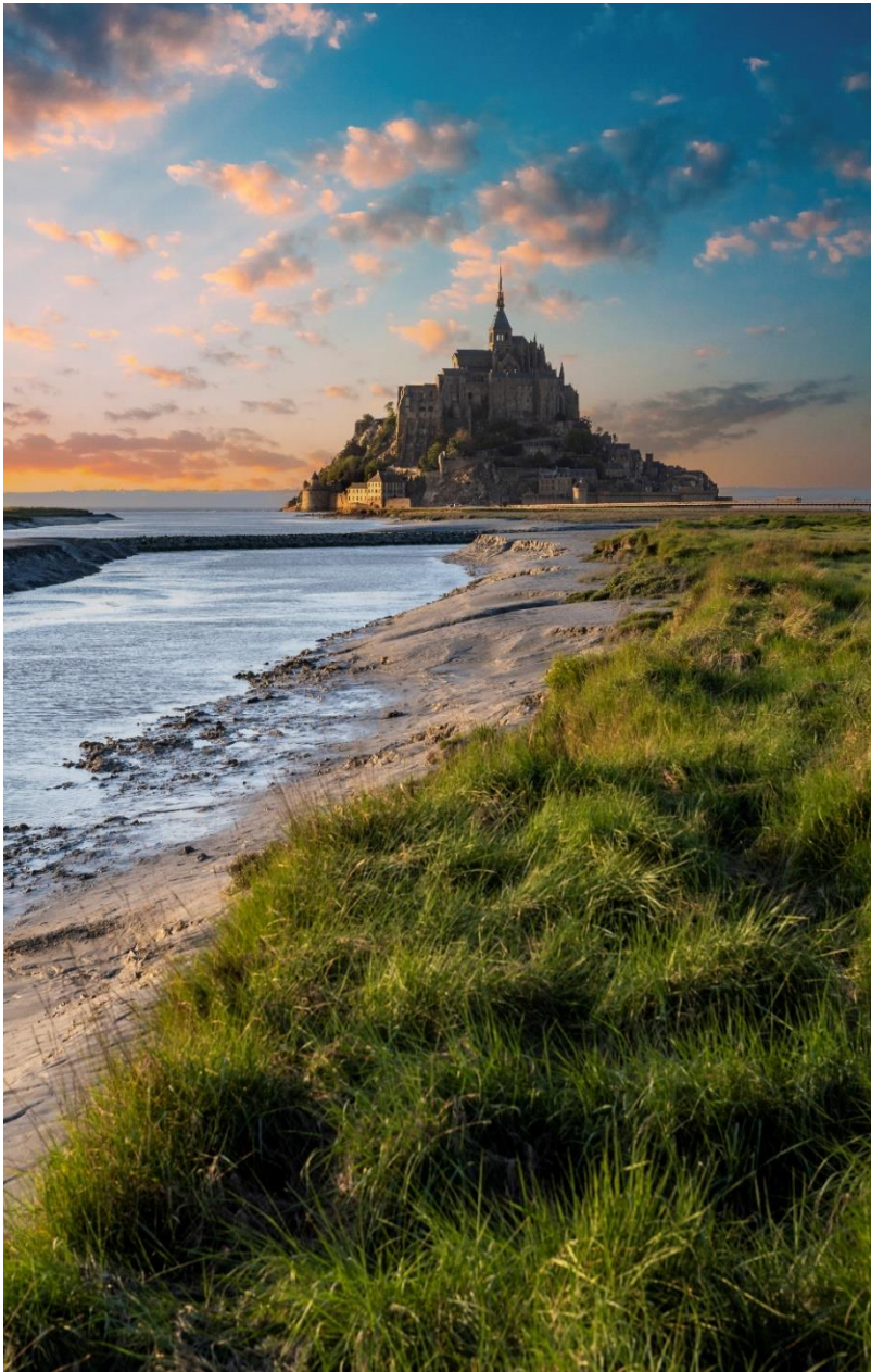
Mont Saint Michel