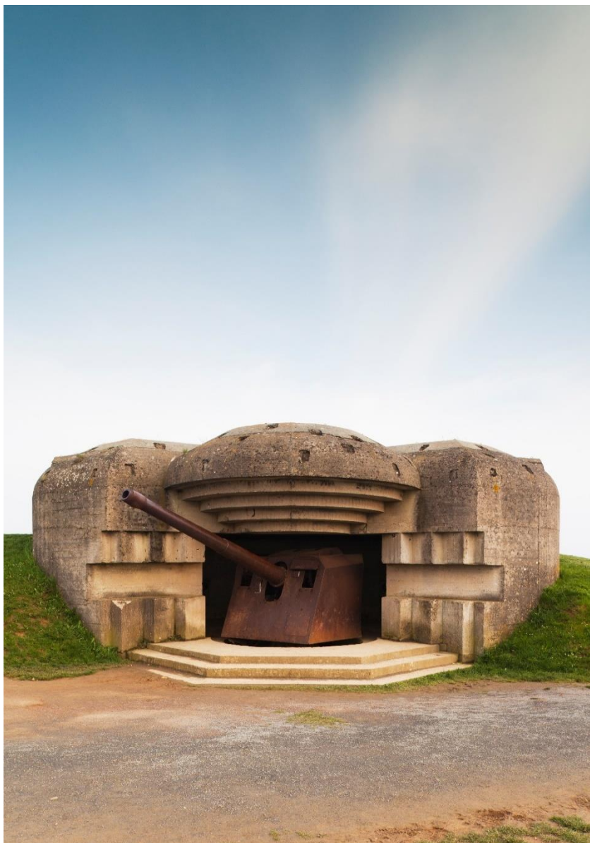
Longues sur mer

Subscription to remote banking services (online, landline, text, etc.): Crédit Agricole En Ligne Part RIB (external transfer option)