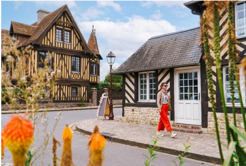
Beuvron en Auge

(1) The foreign exchange transaction will be carried out at the exchange rate applied by Visa or Mastercard on the date the transaction is processed. This rate is expressed as a percentage margin applied to the exchange rate published by the European Central Bank (ECB). See examples at: