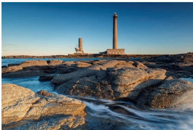
Phare de Gatteville

(1) Your advisor is available to provide you with more information.