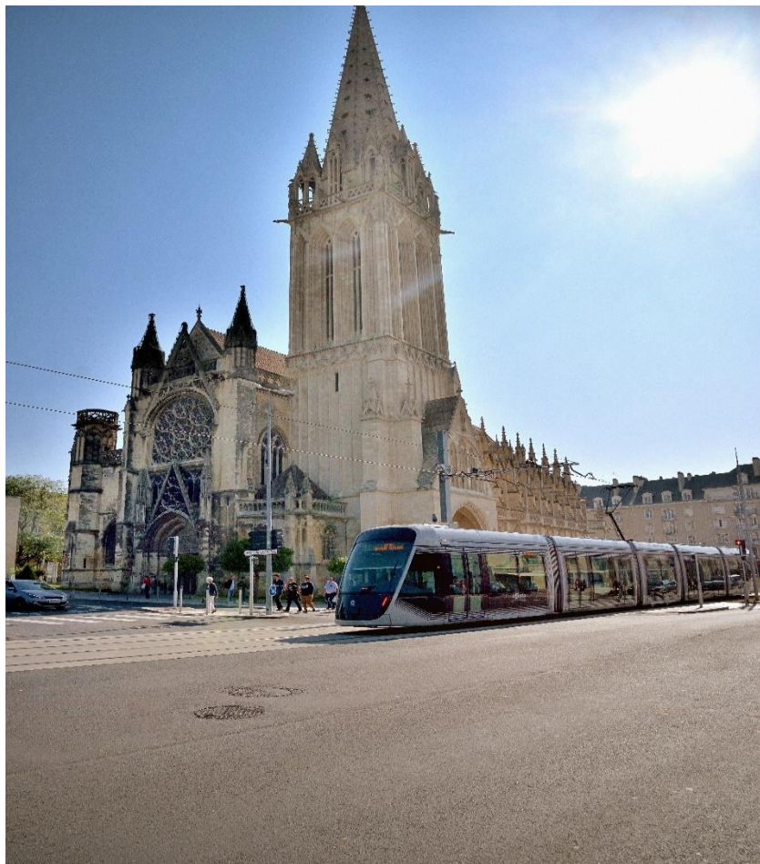
Eglise Saint Pierre – Caen

(1) The use of the application requires the use of a communication terminal compatible with Internet access and a subscription to the Crédit Agricole En Ligne service.