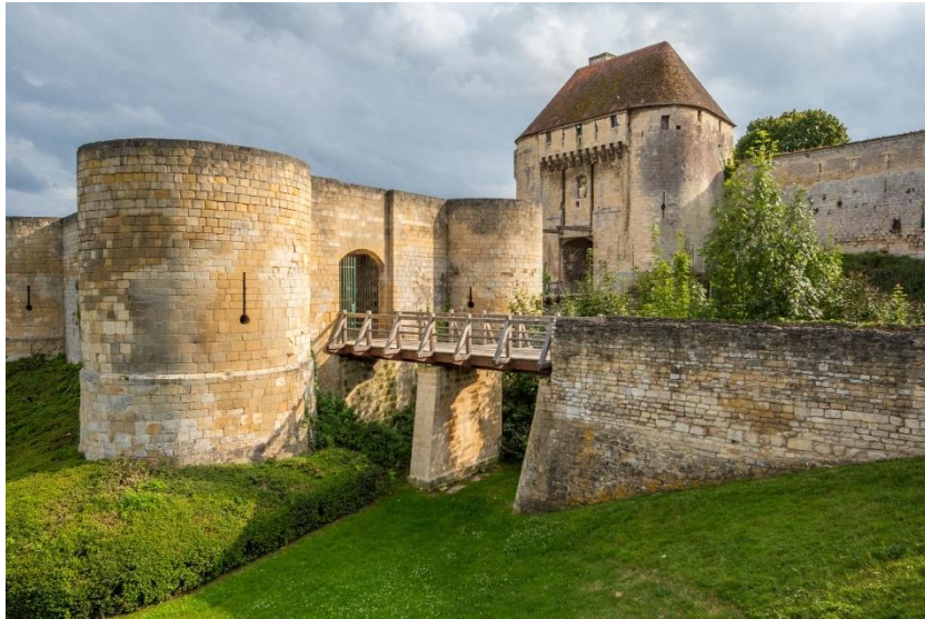
Château de Caen

(1) If unsuccessful for lack of funds, capped at €20.