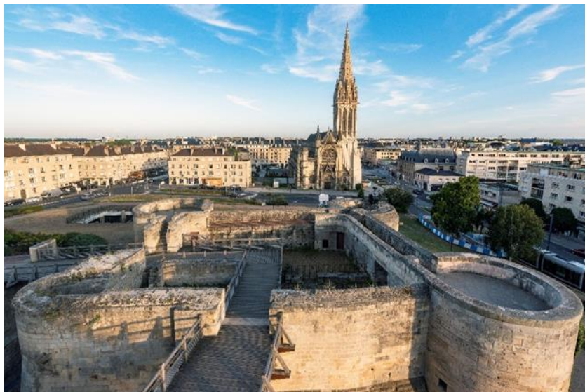
Château de Caen