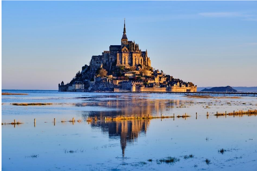
Mont Saint Michel